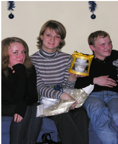
Some residents at our Christmas party

Check out stories, pictures, and more on our website: www.theharborspb.org