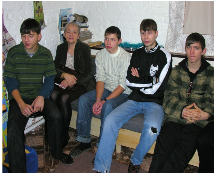
A new group at the Vocational Training Center