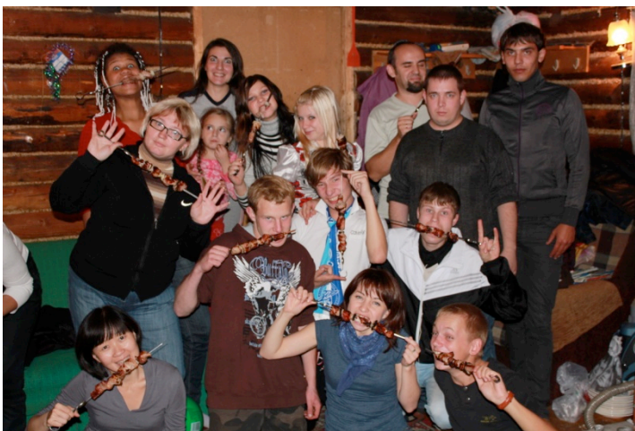
Some of the residents learn to grill out